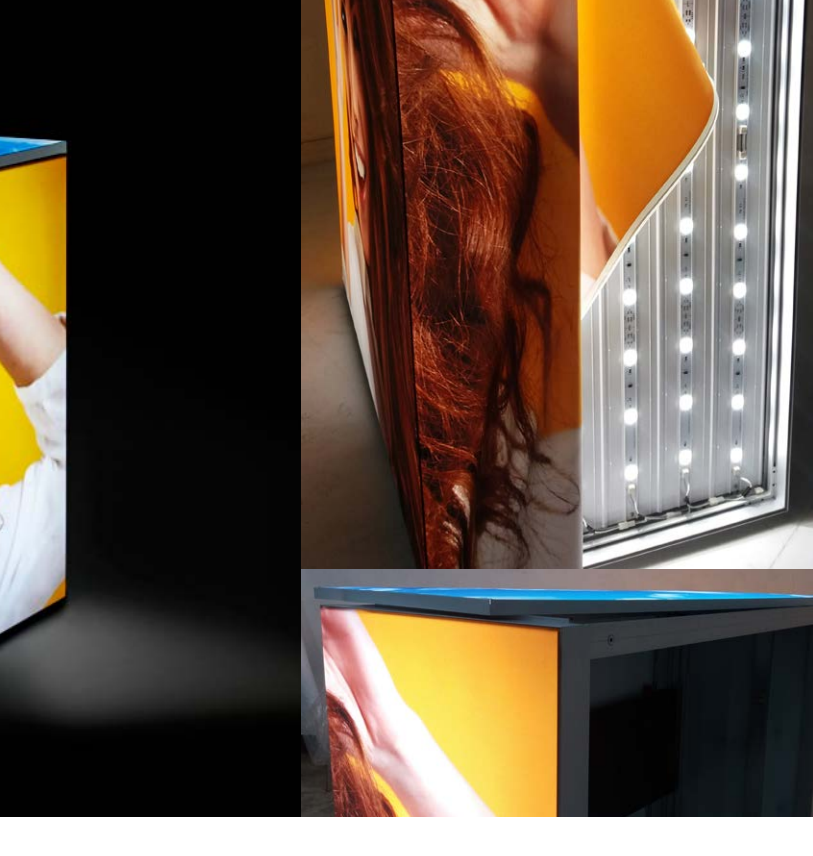
Table Light Box for Trade Show Counter is one of our top-selling trendy portable display booth accessory kits! Now exhibitors can replicate that eye-catching appeal throughout their entire trade show booth with our LED Light Box Trade Show Graphic Backlit Counter Table! This lightweight backlit table includes a portable modular frame that allows folder type, offering the trendy trade show LED lighting. Vibrant colors and images are printed on special premium fabrics, using our HD dye sublimation exhibit printing technology.

Edge-lit frames are available in both single-sided and double-sided options. Single-sided suits are suitable for a wall-mounted Fabric Light Box. The double-sided option opens up even more possibilities, as it can be free-standing or suspended from a ceiling. It allows either the same message to be displayed on both sides or else allows two different messages to be shown at once.